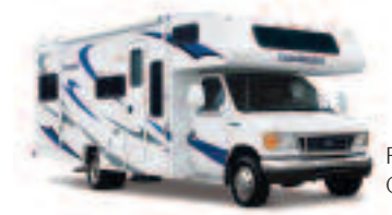
Frelander Class C Motorhomes

The unique Frelander Fast Lane (3130IS) is the perfect motorhome for the family on the go. From tailgating to enjoying an evening with the family, the huge sofa lounge, island countertop and marine style stools make it easy for everyone to join in on the fun. (Shown in Windsor Wine decor)